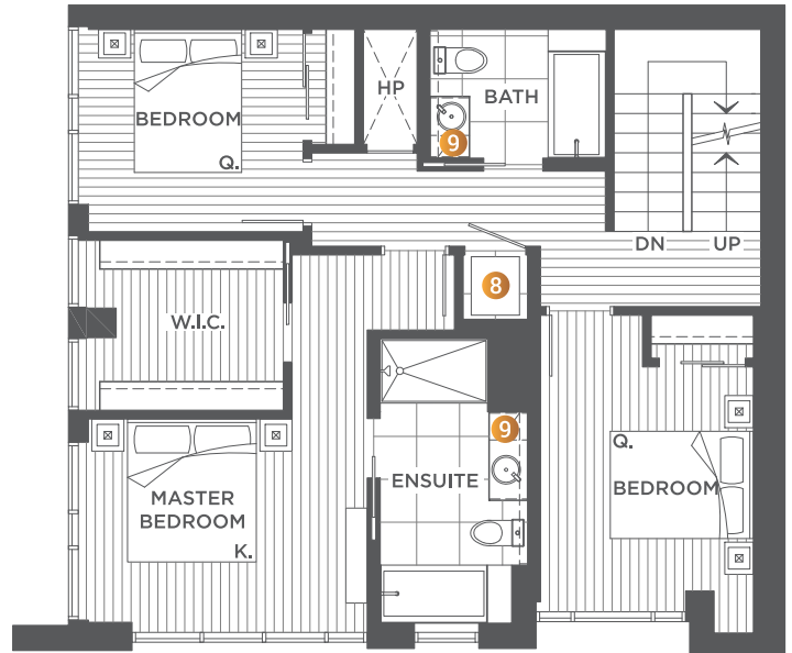
MAIN FLOOR 845 sq ft